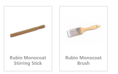
Clean the tools with water after application.