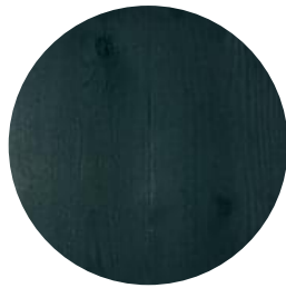
RUBIO MONOCOAT GREEN